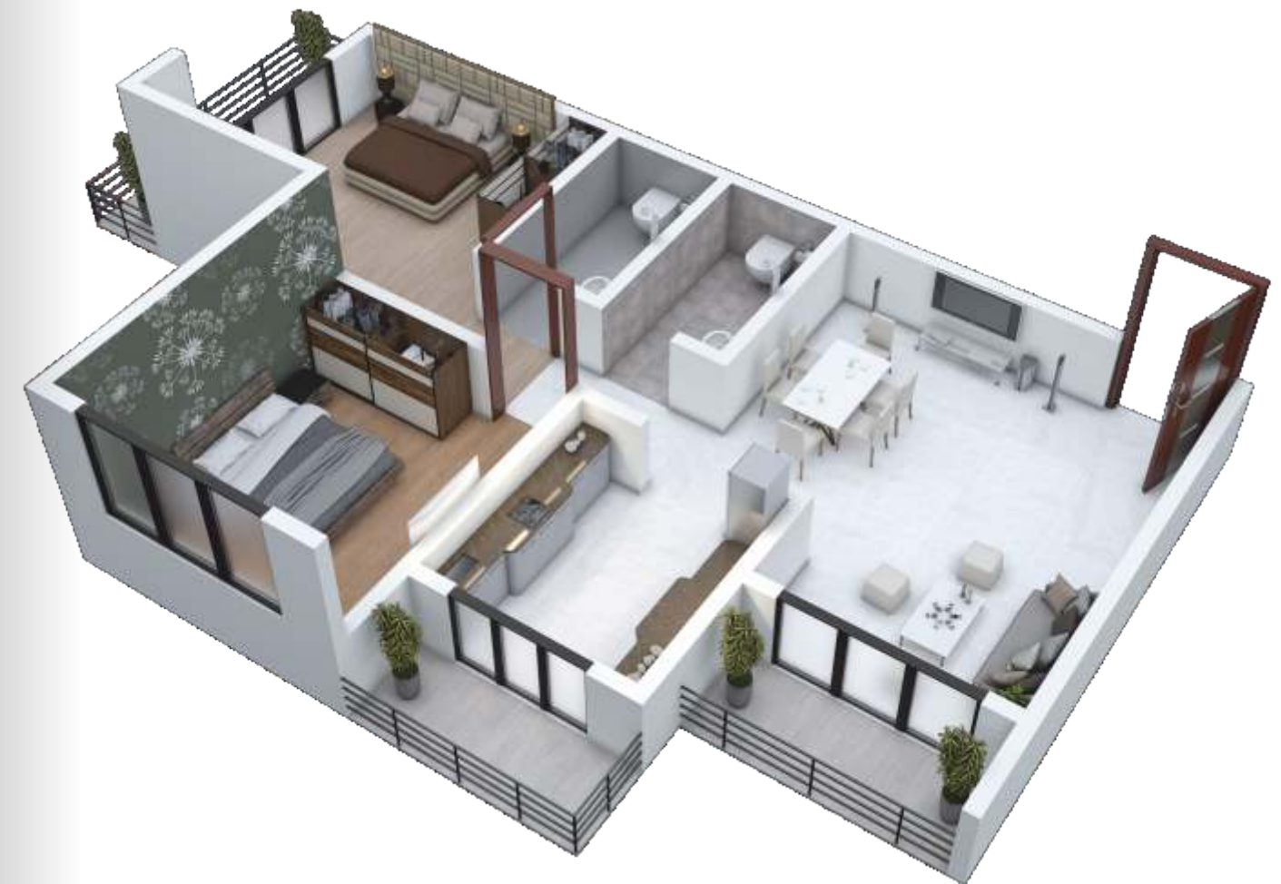
2 BHK with Dining Space