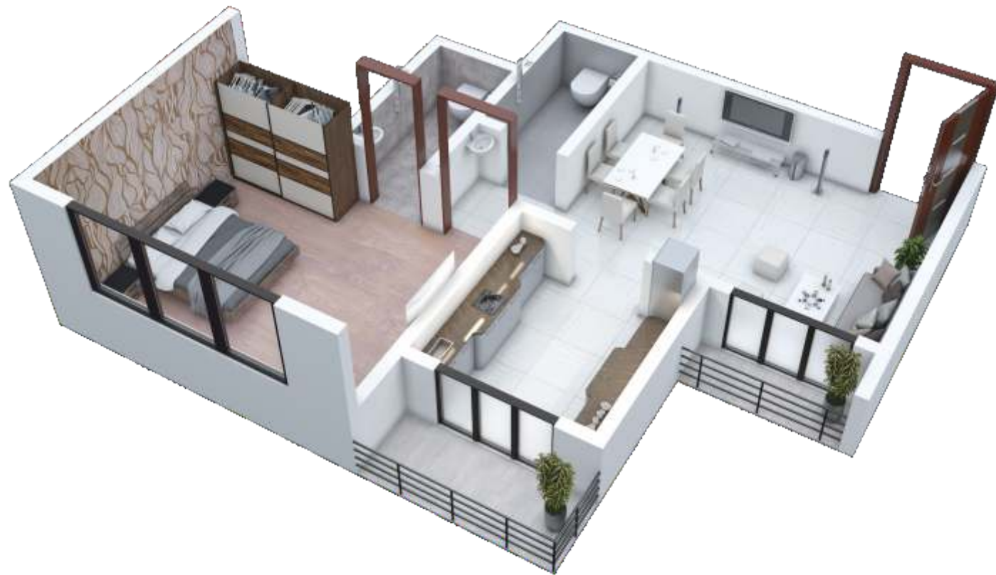
1 BHK + Dining & Master Bedroom

| Special water proofing treatment with China Chips.